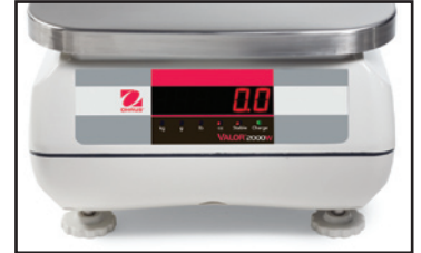
Valor 2000 with rear LED display